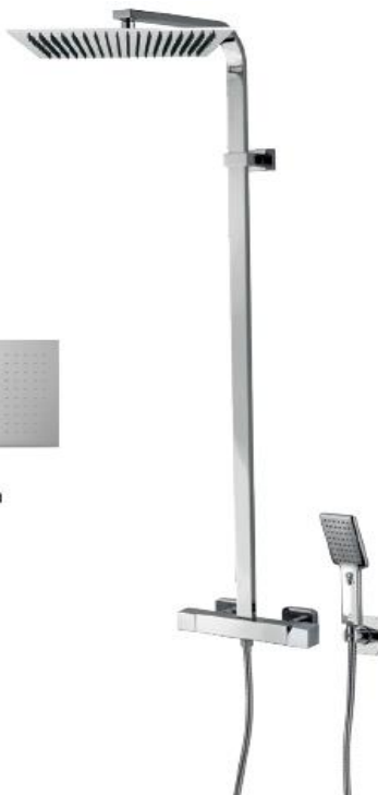
100877 TETIS 400 X 260 mm