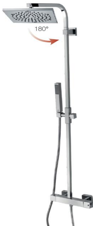
Immagine Prodotto - Product Image

Настенная колонна из латуни сечение 20 x 20 мм - душевая лейка CUBE 260 x 260 мм - ручной душ - держатель для душа фиксированный - гибкий шланг из латуни дв. фальцевания 150 см соединение 1/2" FF - смеситель термостатический